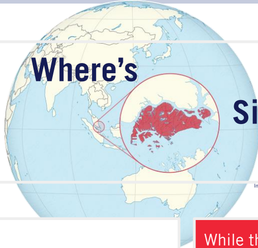
Image: Singapore on the globe (Southeast Asia centered) zoom.svg by Seloloving on https://en.wikipedia.org/wiki/Singapore is licensed by CC BY-SA 3.0. Colour modified.