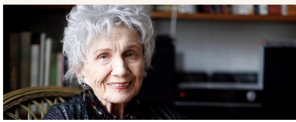
Alice Munro Nobel Prize in Literature (2013)