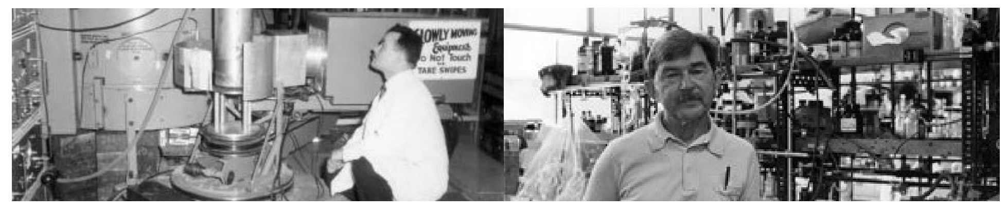
Bertram Neville Brockhouse | 1918 – 2003 Nobel Prize in Physics (1994)