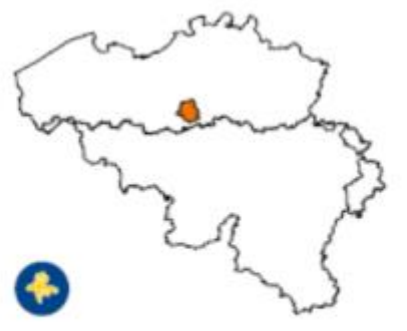
The Brussels-Capital region