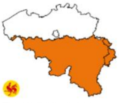
The Wallonia region